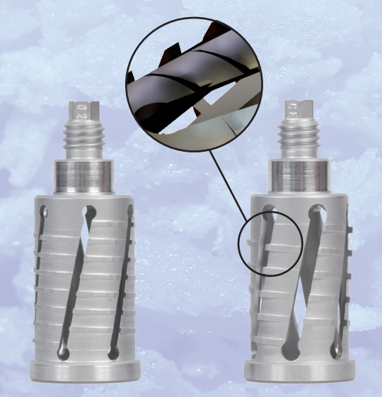
Two types of milling drums for various chip sizes. Each milling drum has spirally positioned teeth.

There are two types of milling drums for the Noviomagus Micro Mill. The Extra Extra Fine Micro Milling Drum produces chips between 1 and 2 mm. The Extra Extra Extra Fine Micro Milling Drum produces bone chips smaller than 1 mm.