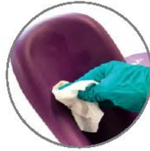
OPTIONAL EASY TO CLEAN SEAMLESS WATERPROOF PADS