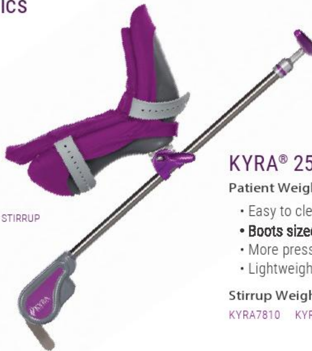
KYRA 250 STIRRUP