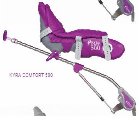
KYRA COMFORT 500