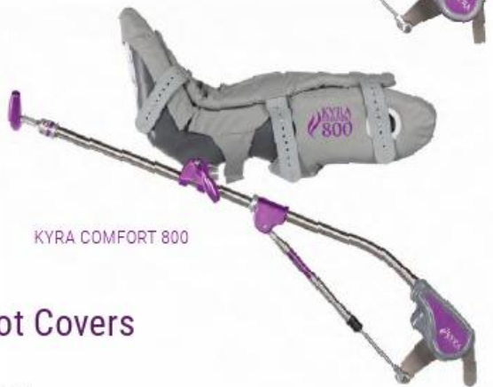
KYRA COMFORT 800