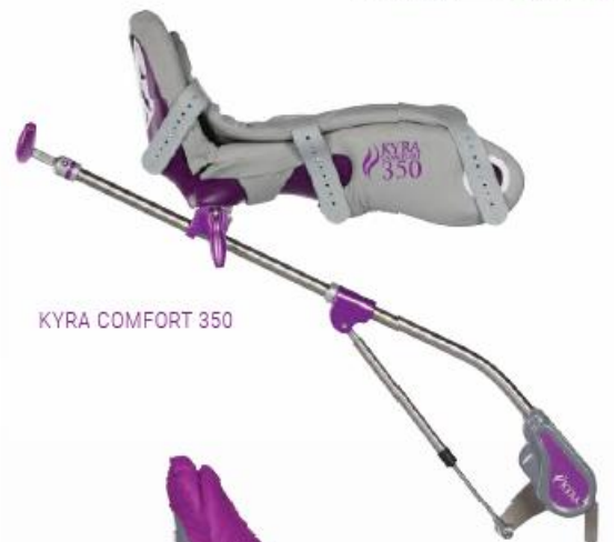
KYRA COMFORT 350

KYRA8100 KYRA Comfort 800 Stirrups w/ Secure-Lok™ silicone straps