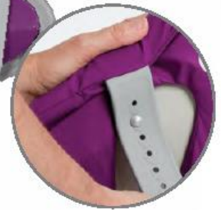
DURABLE SILICONE STRAPS