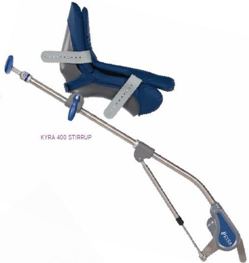
KYRA 400 STIRRUP

KYRA7100 KYRA 400 Stirrups w/ Secure-Lok™ silicone straps